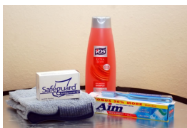
Toothpaste a Toothbrushes Shaving Cream and Razors Shampoo and Conditioner Women's Hygiene Products

Thank you for your consideration of a monthly or one-time contribution and for your donation of hygiene items, baby needs, and/or bedding. Almost every person who comes through our doors is blessed by one or more of the hygiene items you send. The list follows: